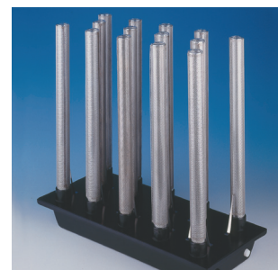
■ aerotron 2000

For larger projects customized units can be made available. Special conditions on site are considered in that single device. Components are optimally tuned on each other. Based on customer information, the bioclimatic team will work out an ideal equipment configuration.